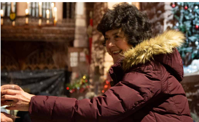
Mulled wine at Carol service