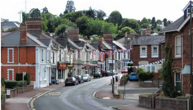
Walnut Road, Chelston