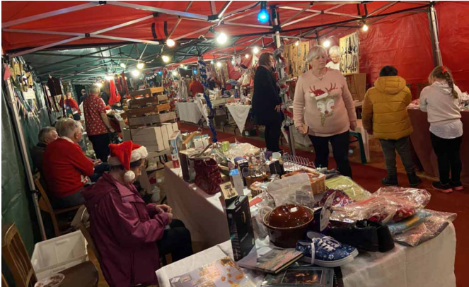
Indoor Christmas Market at St Matthews