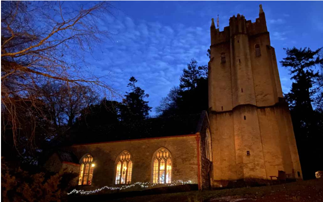
St George & St Mary (Cockington Parish Church)