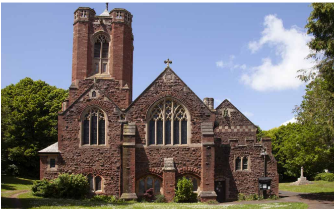
St Matthew's Church

Neither church has a graveyard (but both have consecrated ground for the burial of ashes). nor do they have a church hall (although St Matthew's does have an undercroft).