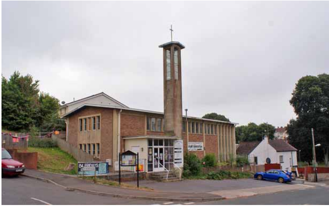
St Peter's Church